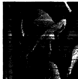
Figure 8: Recovered Lenna image using SD-ROM.