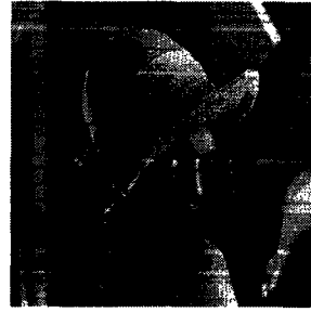
Figure 3: The original Lenna image.

The neural selector in the AFRS filter converges after 5 to 20 epochs of learning. The filtering results of the AFRS , RCRS , SD-ROM and fuzzy filter are shown in Table 1. From the table we can see that the filtering capability of the AFRS filter is better than the RCRS , SD-ROM or the fuzzy filter.