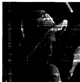
Figure 7: Recovered Lenna image using RCRS.