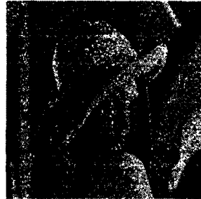
Figure 4: Lenna image corrupted with 30% of noise.