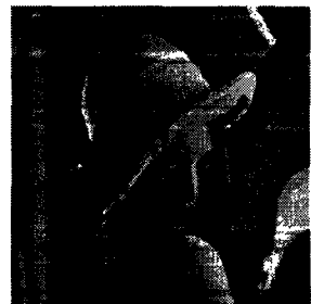
Figure 6: Recovered Lenna image using FF.